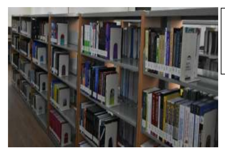
Figure 8: Collection of Open Shelf

A collection of books covering all subject areas offered by the UIM as well as subjects of general interests