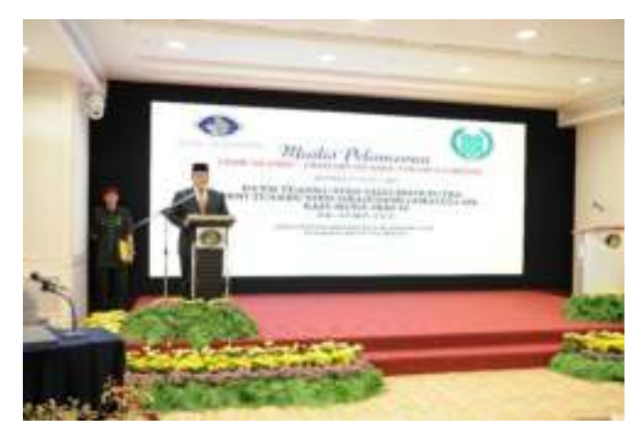
Figure 2: CIMB Islamic Library launching ceremony-Primary Islamic Finance Library