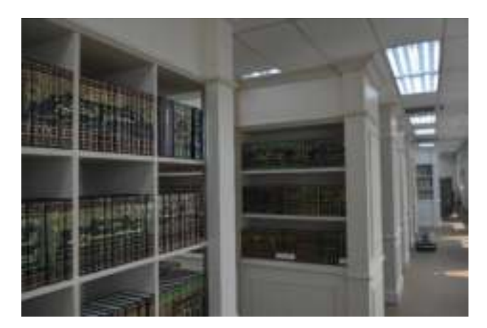
Figure 5: Collection of Waqf and donations

On 2019, UIM Library are moving to another place at Petaling Jaya on Level 2, Khadijah Building, PT1, Jalan Profesor Diraja Ungku Aziz, 46350 Petaling Jaya, Selangor. We are already fully operational.