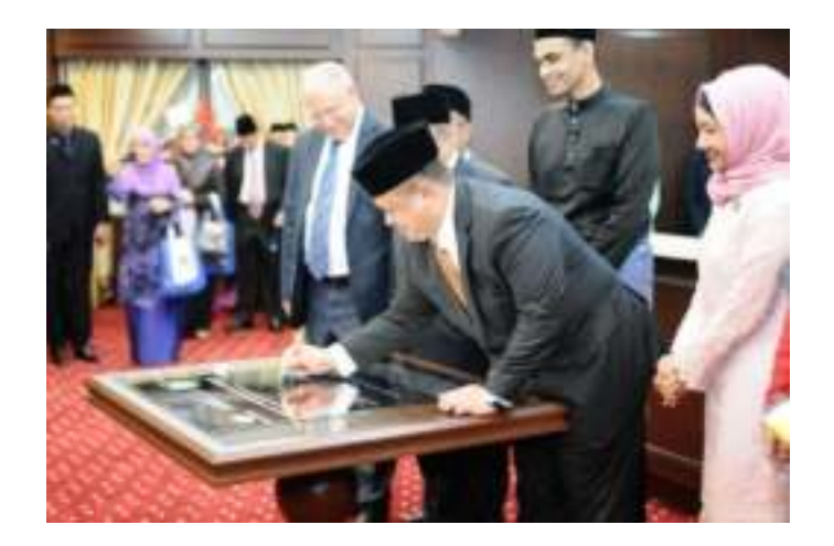
Figure 1: CIMB Islamic Launching Ceremony - Primary Islamic Finance Library by DYTM Tuanku Syed Faizuddin Putra Ibnu Tuanku Syed Sirajuddin Jamalullail