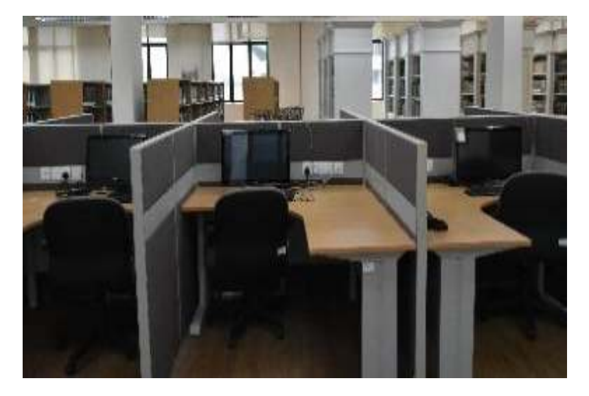
Figure 6: Area of computer

User can use any provided PC in the premise with free internet access.