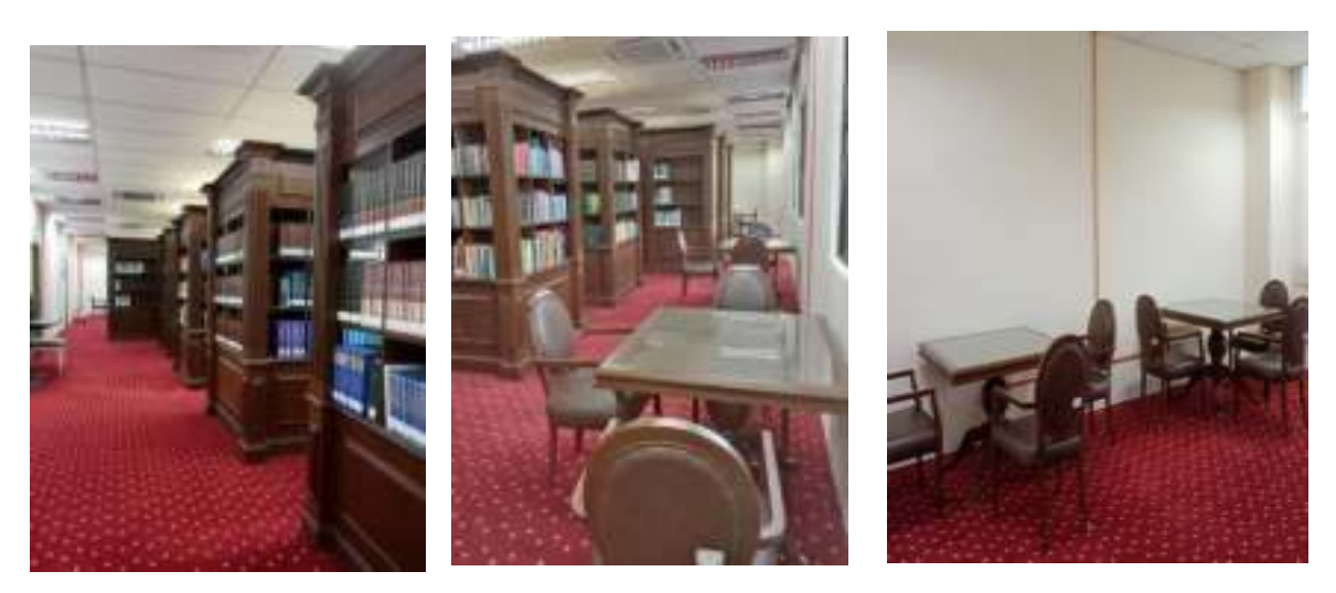
Figure 3: CIMB Islamic Library- Primary Islamic Finance Library