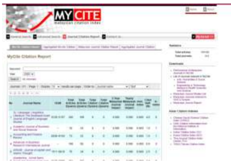
Figure 11: Front page of MyCite