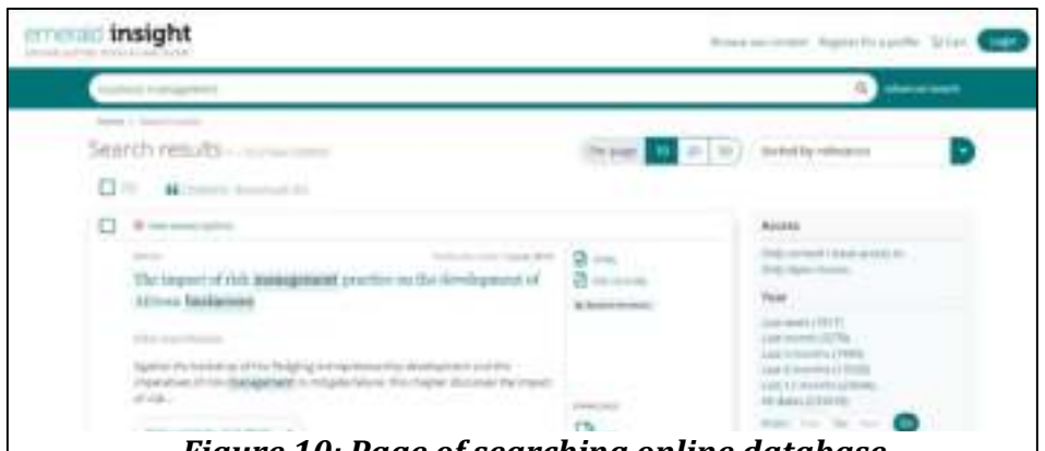
Figure 10: Page of searching online database

("And"), any one of the terms in each article ("Or") or find articles that contain one term, but do not contain another ("Not").